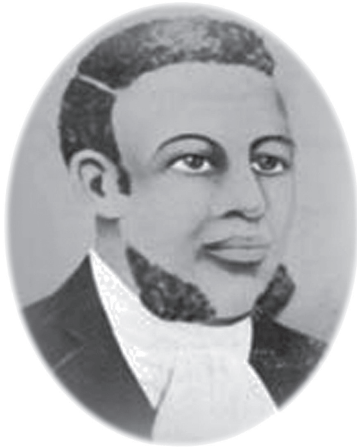
Rev. Lott Carey 1780 – 1828